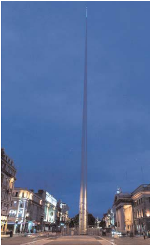
Above Ian Ritchie's 120 metre needle in O'Connell Street. The General Post Office is on the right