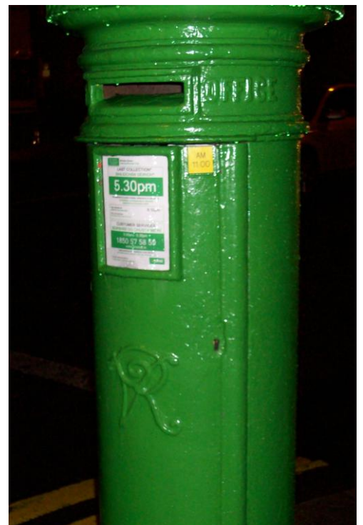
A Pillar Box in Mountjoy Square