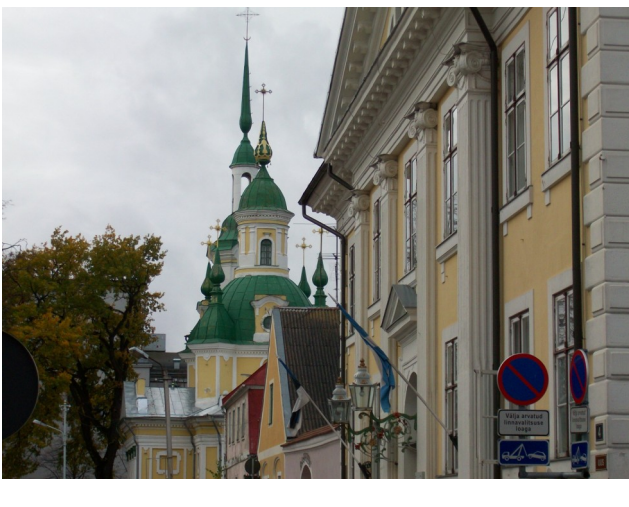
18th Century buildings in Parnu, Estonia - royal seaside resort and cultural capital.