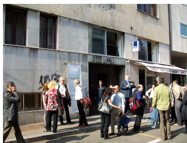
ASSITEJ Executive members outside the new Secretariat in Zagreb. No frills.