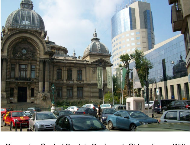
Romanian Central Bank in Bucharest. Old and new. With global capitalism in freefall, which building will still be standing in 2108? And everyone has borrowed money to buy a car ...