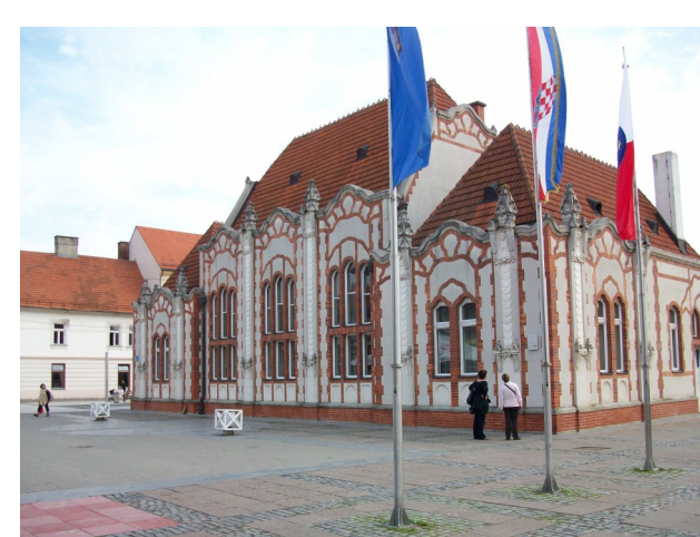
The former Jewish 'casino' in Cacovec, Croatia.