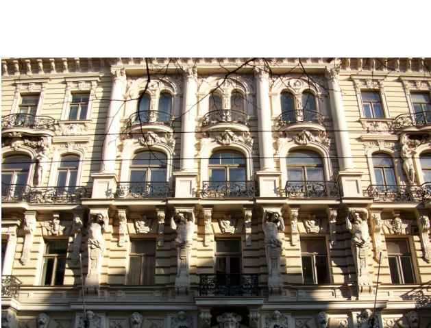
Jugendstil extravagance in Riga, wealthy and cultured since the 16th Century. A mix of German and Russian traditions with the arts crucial to expressions of national identity.