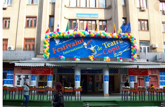
Teatrul Ion Creangu, Bucharest, host of the 100,1,000, 1Million Stories Festival 2008 .