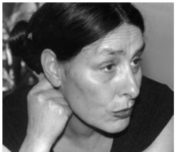
Writer, Suzanne Lebeau

A simplified and focused approach to World Day will strengthen opportunities for advocacy internationally. This will continue to be supported by a message by prominent personality or celebrity, For 2012 the message will be from renowned Canadian playwright Suzanne Lebeau